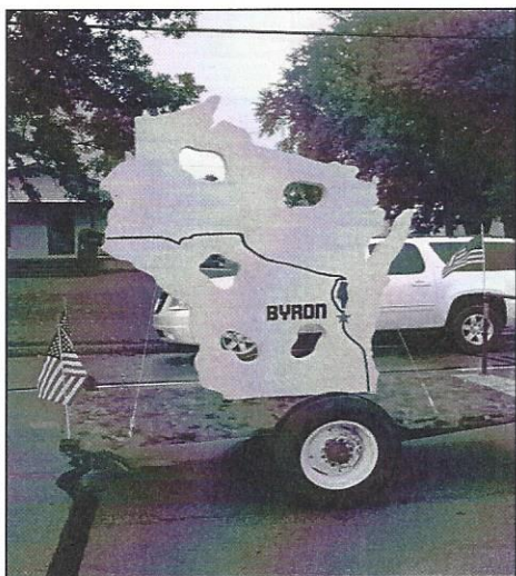
Map showing route of Yellowstone Trail through Wisconsin

In the days before interstate highways, Highway 175 was "the good road" for individuals traveling from the northeastern United States to attractions in the west, such as Yellowstone Park.